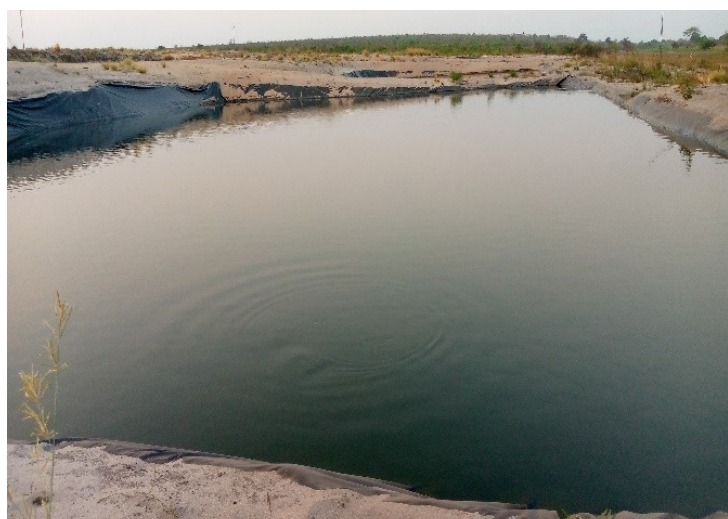
Figure 3: A lined fishpond

Making reference to the images in Figure 2 and 3, unlined fishponds had a lot of boarder and floating vegetation. The water in these ponds came from the ground with no external water source present and no proper form of an existing water draining technique. Antithetically, lined fishponds had no boarder or floating vegetation, with an external water inlet and a proper draining technique and routine employed where water was drained and replaced once every seven days. The un-lined fishponds where 8, making up 31% and ranged from labels A to H and lined fish ponds where 18, making up 69% and labelled I to Z of the sampled fishponds as summarised in table 1.0.