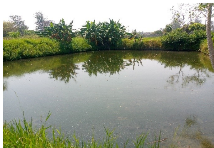
Figure 2: An unlined fishpond

There were 26 fishponds sampled of which 2 types of ponds were included in the study, that is lined and un-lined ponds.